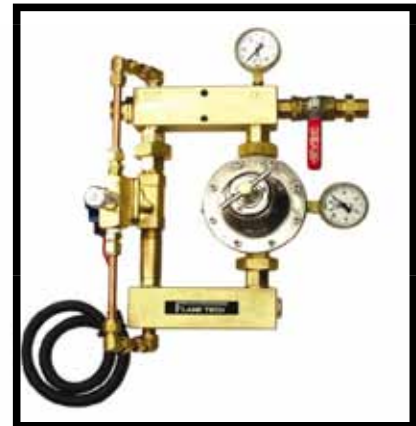
GMR-F & GMR-PO

Cleaned per CGA G-4.1 for oxygen service