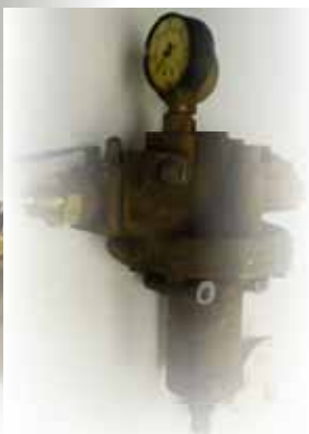
Your old GEGA®