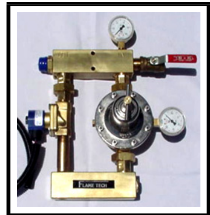
GMR-CO System uses Flame Tech's New GMR Series of Regulators